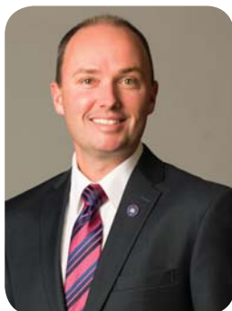
Utah Lt. Governor Spencer J. Cox